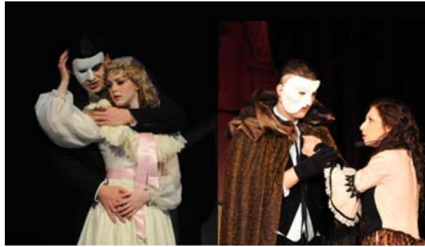
Left: Elon University. Right: Carroll Senior High School